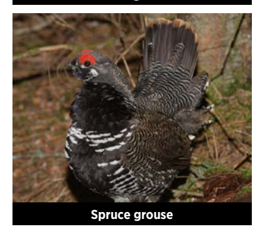
*Subject to change.